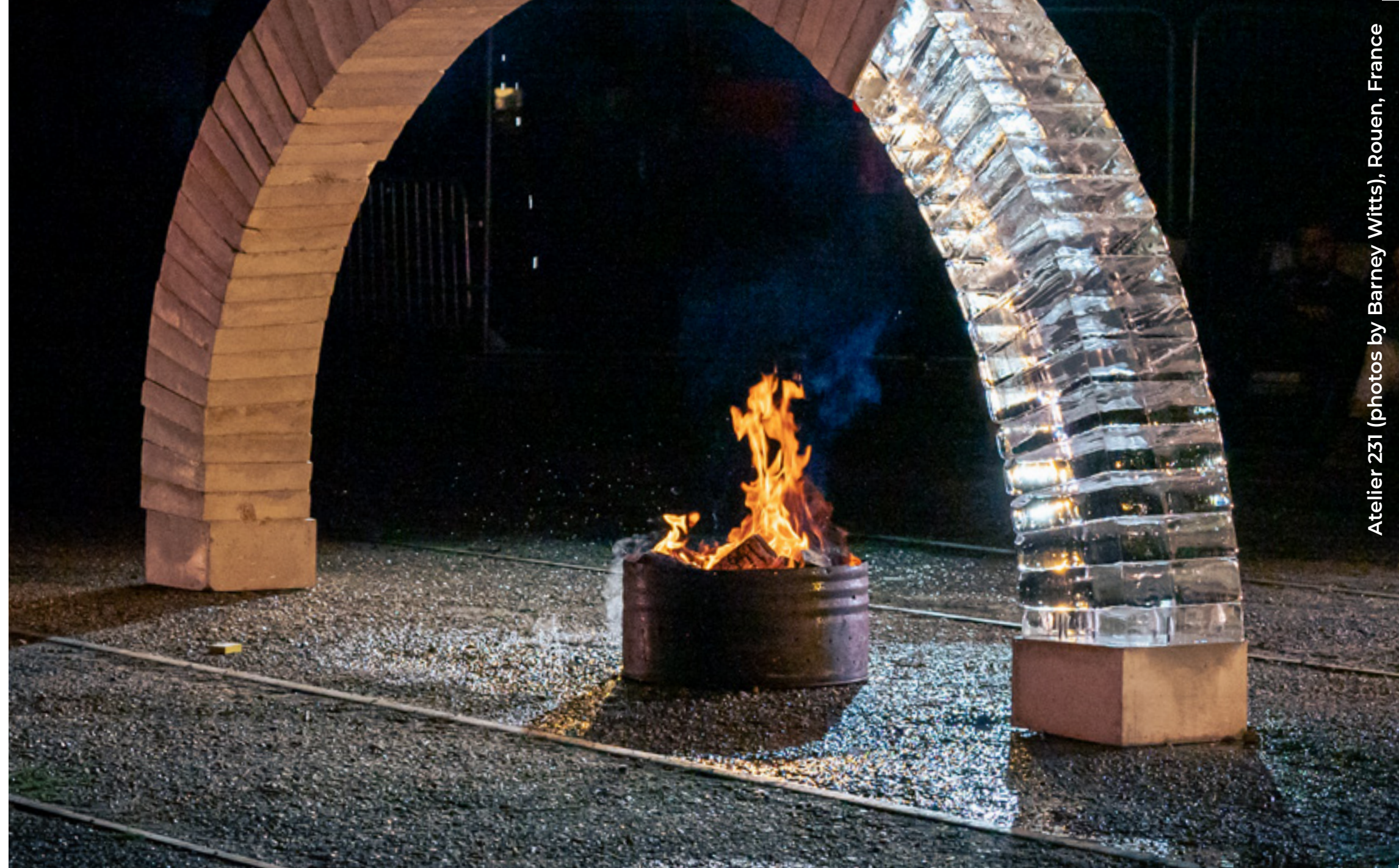
Atelier 231, Rouen, France