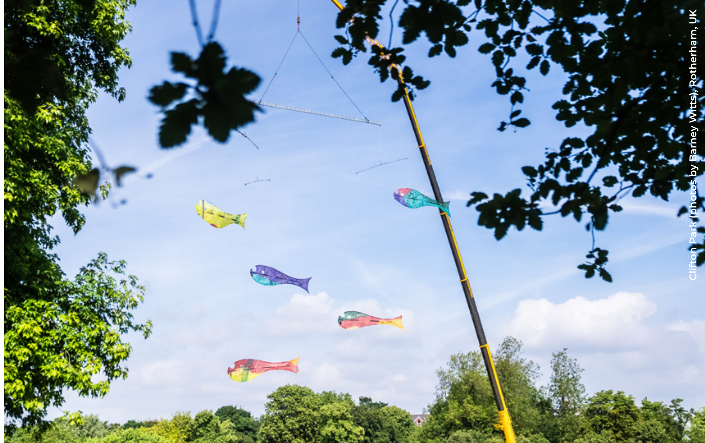
Clifton Park, Rotherham, UK