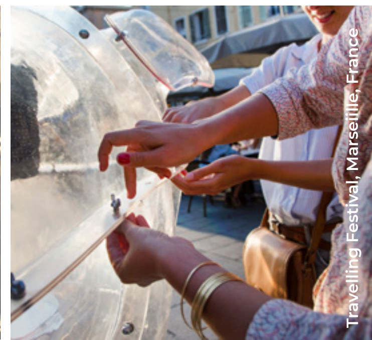
Travelling Festival, Marseille, France