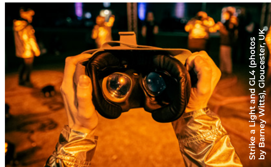
Strike a Light and GL4, Gloucester, UK