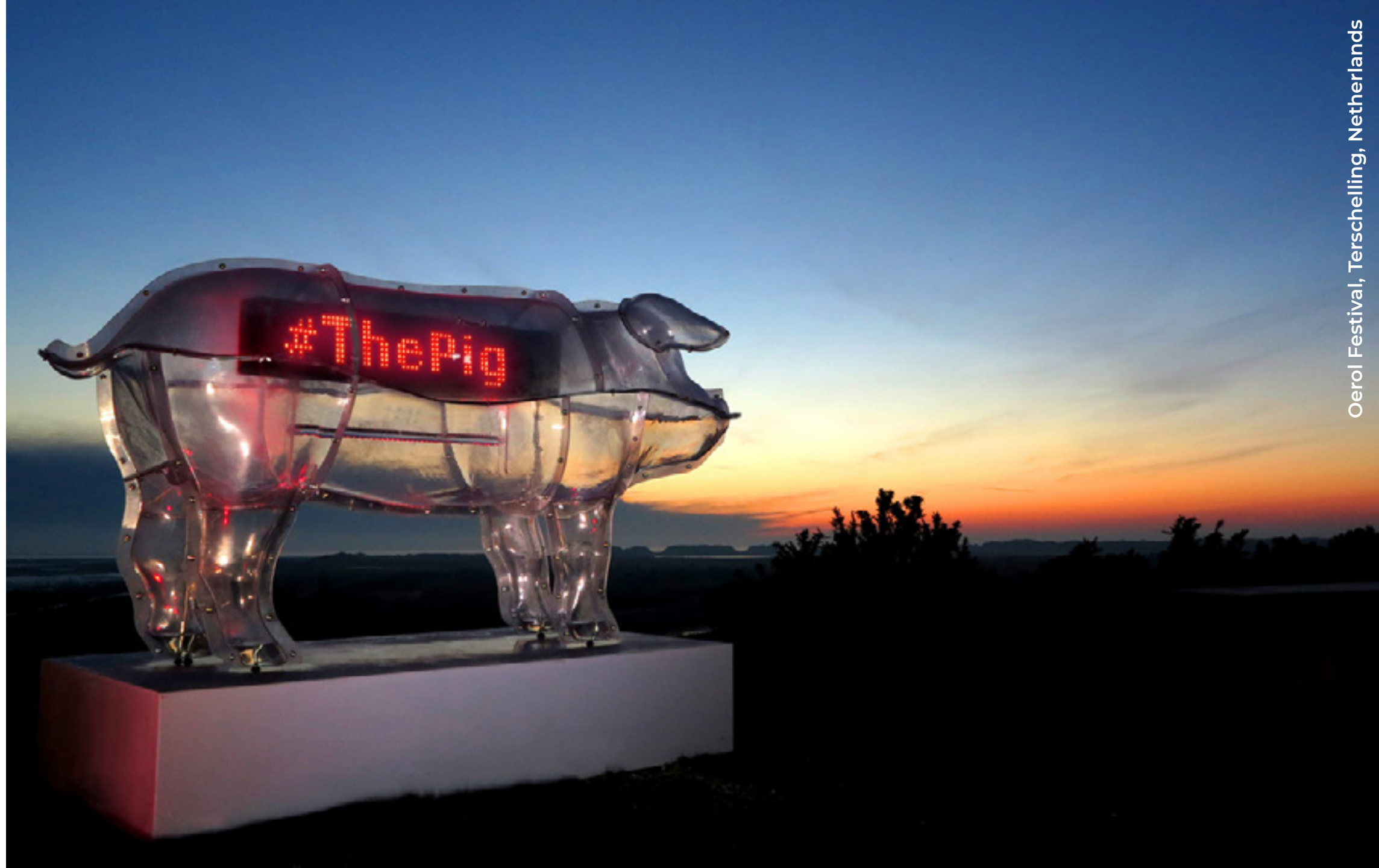
Oerol Festival, Terschelling, Netherlands