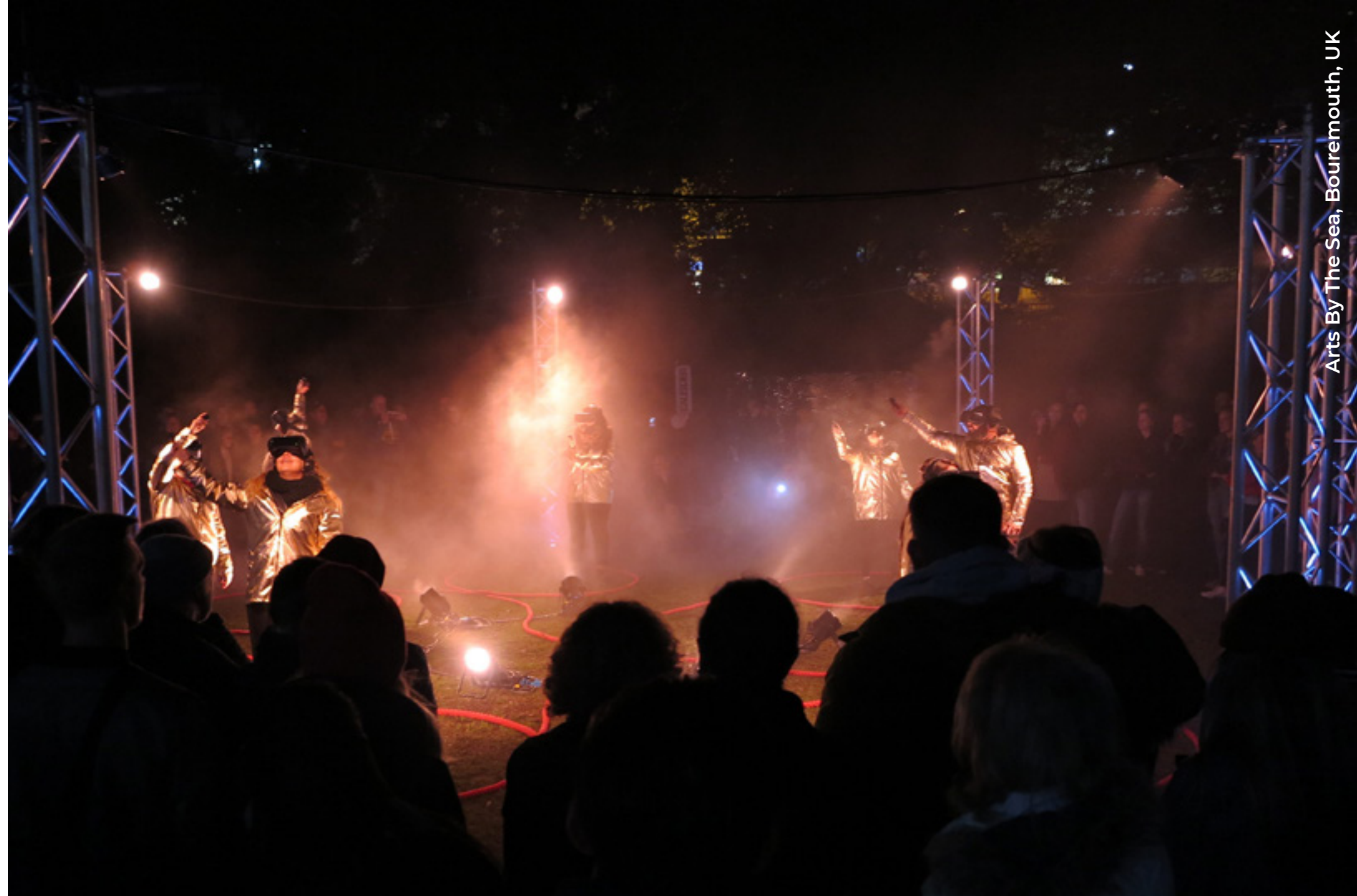
Arts By The Sea, Bouremouth, UK